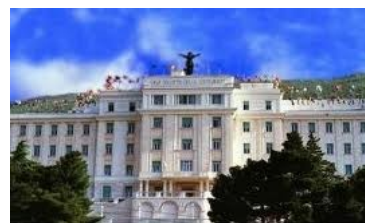
Casa Sollievo Della Sofferenza in San Giovanni Rotondo, Italy

As Padre Pio said, we will build a "Cathedral of Love", "A Clinic for the Body & the Soul", to serve the "Twice Jesus" in the poor and the sick. The Casa USA will be the fruition of the long awaited vision expressed by the Director originally chosen