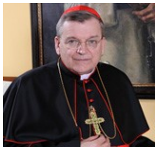
Cardinal Raymond Burke –Episcopal Advisor of CHI –Patron of the Sovereign Military Order of Malta