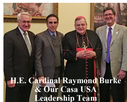
H.E. Cardinal Raymond Burke & Our Casa USA Leadership Team