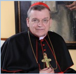
Cardinal Raymond Burke –Episcopal Moderator of CHI –Patron of the Sovereign Military Order of Malta