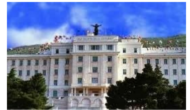
Casa Sollievo Della Sofferenza in San Giovanni Rotondo, Italy

As Padre Pio said, we will build a "Cathedral of Love", "A Clinic for the Body & the Soul", to serve the "Twice Jesus" in the poor and the sick. The Casa USA will be the fruition of the long awaited vision expressed by the Director originally chosen