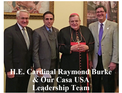
H.E. Cardinal Raymond Burke & Our Casa USA Leadership Team

A beautiful replica pilgrim shrine of St. (Padre) Pio's Church Santa Maria delle Grazie , a replica of his renown Home for the Relief of Suffering hospital, a truly Catholic medical school fully faithful to the Magisterium of the Church, a Christ Medicus Foundation National Center for Public Policy , and a Terri Schiavo Life & Hope Network Center upholding human dignity through service to the medically vulnerable...all resting on a tranquil campus in the town of Howell, Michigan (Less than an hour drive from Detroit). This is no longer just the vision, but now the active collaborative plan being implemented by the leaderships of Catholic Healthcare International & the Diocese of Lansing, Michigan with the blessing of St. Pio's Casa hospital in Italy. This Casa USA campus will be a national "Beacon of Light" & model of truly faithful Catholic healthcare delivery for our country, to be emulated by other Catholic healthcare providers currently challenged by our increasingly secular culture.